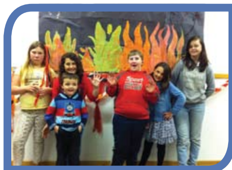
Bairns at North Roe Youth Club.